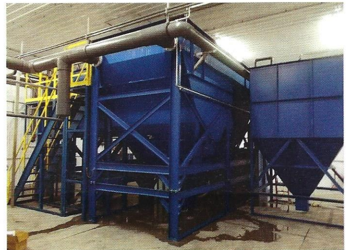
Figure 4. Inclined plate clarifier

Chemical precipitation has been practiced as soda-lime softening for many years as a means of softening very large volumes of water. Recent development of soda-caustic precipitation combined with inclined-plate clarifier technology has made this method of producing softened water practical for smaller (down to 10 gpm) installations. Such installations would dewater the precipitated hardness ions, which would be disposed of as a solid waste. There is no discharge of any wastewater from an inclined-plate clarifier equipped with a filter press (see Figure 4).