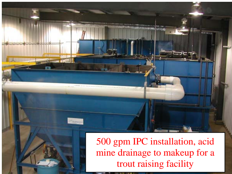
500 gpm IPC installation, acid mine drainage to makeup for a trout raising facility

ProChemTech manufactures a complete line of IPC's to operate at flow rates ranging from 5 gpm to 500 gpm. Higher flow rates can be managed by aligning multiple IPC units in parallel. ProChemTech's inclined plate clarifiers have several features not found in competitive units. These include fully adjustable V-notch weirs constructed of stainless steel and fiberglass, easily removable plate packs constructed of polished fiberglass, zero head loss entry into the plate pack, integral "square" dimension mix and post clarifier tanks, and sludge collection hoppers with no moving parts. These features result in an inclined plate clarifier that, we believe, is simply the best unit manufactured in the world today. The performance of ProChemTech inclined plate units is best demonstrated by the clarity of the effluent, most units operate with an effluent turbidity less than 1 ntu, with many units at levels less than 0.5 ntu.