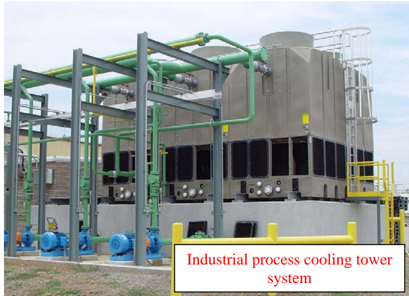
Industrial process cooling tower system

Costs for water and sewage disposal will continue to increase for at least the next ten years due to environmental regulations and almost complete use of the available fresh water capacity in many areas. Attempting to cut costs, many industries have begun to search for ways to recycle and reuse their cooling water. Systems that accomplish this goal normally rely on a cooling tower to reject heat and cool the recirculated water down to usable temperatures.