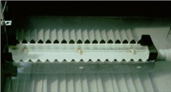
ProChemTech's highly effective adjustable V-notch weir.

One of the workhorses of the ProChemTech line of treatment equipment is the inclined plate clarifier (IPC). This device provides effective removal of suspended solids from high flows of wastewater using minimal floor space. Slanted plates are set at an angle to the flow to dramatically increase the surface settling area as compared to a typical settling tank or clarifier.