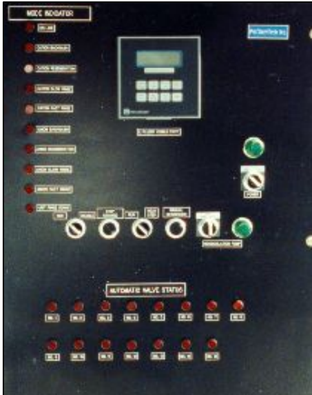
PCT manufactured ion exchange unit control panel.

Use of specific ion exchange resins for removal of targeted ions, such as copper, nickel, tin, and lead has proven to be very effective for treatment of specific wastewaters for reuse/recycle and discharge.