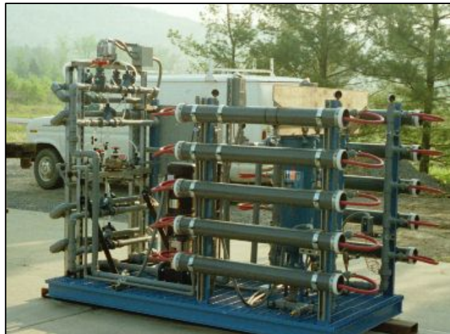
A ProChemTech manufactured microfiltration system awaiting shipment at our scenic Pennsylvania assembly facility.

In many situations, stringent requirements must be met before wastewater can be safely recycled, reused, or discharged to the environment. In these cases, where premium water quality is a requirement, membrane technology is often the method of choice. This advanced technology is useful for the removal of suspended solids, breaking of emulsions, and/or decreasing of dissolved solids. Membrane technology, which includes the specific processes of reverse osmosis, nanofiltration, ultrafiltration, and microfiltration, essentially is a cross flow filtration process using membrane elements which have "pores" of specific, predetermined size. Water under pressure is supplied through as permeate, while the suspended and dissolved solids are removed in a reject of concentrate stream. Membrane technology is now a practical solution for many industrial treatment problems.