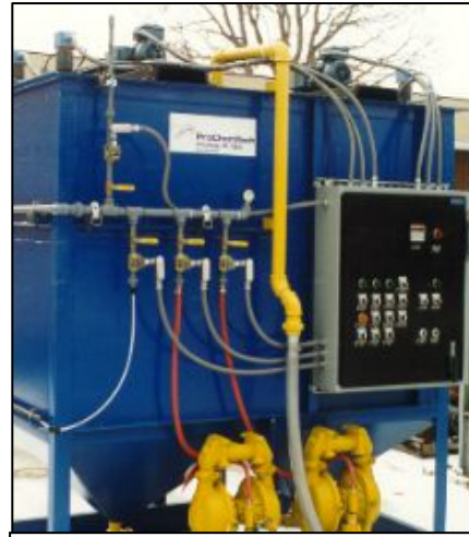
Sequential Batch Unit

Where the wastewater flow is low, an IPC based system is often too costly for consideration. ProChemTech has devised programmable logic controlled (PLC) sequential batch systems (SBS) which provide a cost effective means to treat small amounts of wastewater; 100 to 4000 gpd. The SBS is an extremely versatile single-tank treatment system that can be used for application of complex treatment schemes. The use of the PLC provides for accurate and consistent chemical additions. In a single tank, a set volume can be subjected to all typical chemical and physical processes such as neutralization, flocculant addition, coagulant addition, settling, decanting of clear water, and removal of sludge.