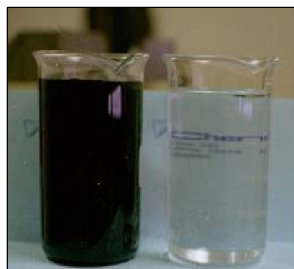
Demonstration of the water clarity achievable with ProChemTech chemistry and equipment