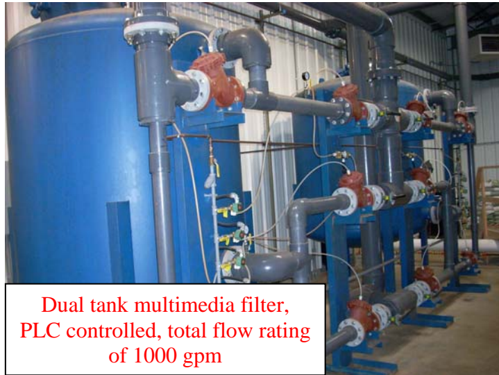
Dual tank multimedia filter, PLC controlled, total flow rating of 1000 gpm

Many times the major problem is simply various suspended solids in the wastewater preventing legal discharge or reuse of the water within the facility. ProChemTech has developed a complete line of single and multi tank pressure filters using multimedia for removal of many different suspended solids. Multimedia, generally consisting of anthracite, sand, and garnet; is much more effective than the typical sand media filter in that solids loading is much higher, reducing backwash water use, and much smaller size suspended solids can be removed. Units can be teamed with polymer flocculation for cost effective removal of suspended solids down to less than 0.5 microns in size.