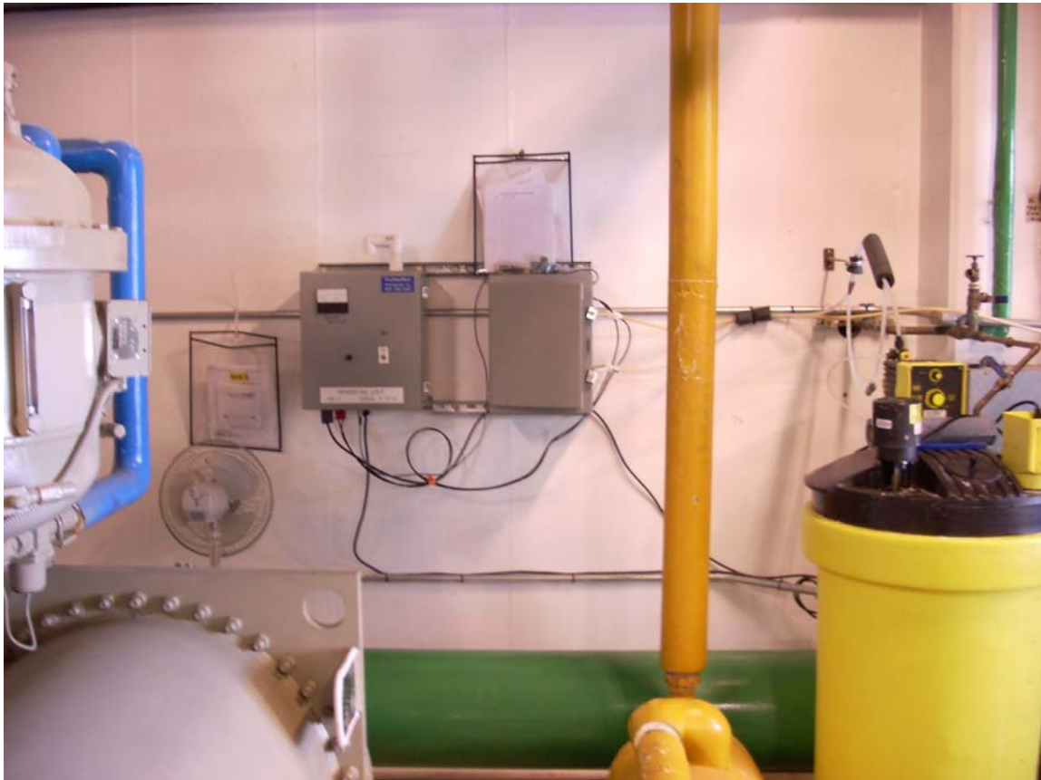
Optional steel cell housing MiniBrom Model MB 5 installed in major hospital power house Yellow plastic dilution tank to the right

MiniBrom units are currently supplied with appropriate chemical pumps and 16 feet of 0.375 chemical grade PE tubing to route the produced bromine solution to the feed point.